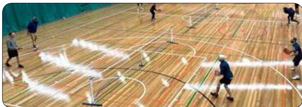
◆ Photo - Pickleball can now be played at the Blackwood Recreation Centre

☐ If you want to come and try a game of 'Pickleball' contact the Blackwood Recreation Centre on 8278 8833 or email: contactus@blackwoodrec.com.au (see free offer in advert below).