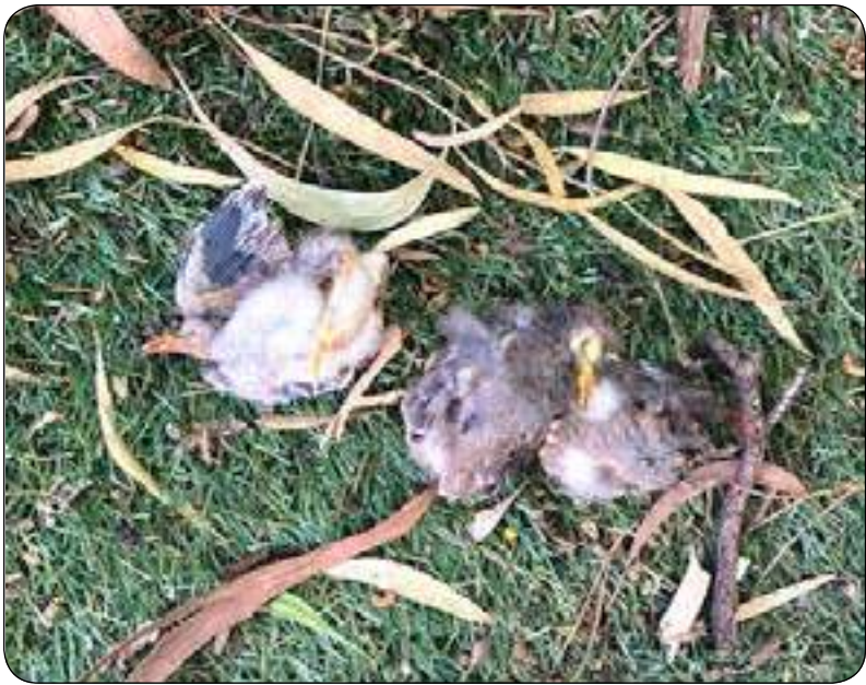
◆ Photo - A concerned Blackwood Times reader sent in this photo ... "I found a tiny dead bird in my carport and 2 more in my garden. Then at dusk, a domestic cat appeared in my driveway. Neighbours tell me they have been concerned in the past about this cat. Apparently from next year, cats will have to be kept within your property. That can't come soon enough for me. Too late for these 3 little victims though."

THE Dog and Cat Management Board are encouraging cat owners to keep their pets safe at home.