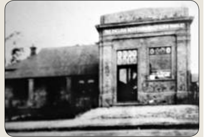
◆ Photo - EW & S Bank (1926-1957), later became the ANZ Bank, and today occupied by The Physio Clinic; located on the corner Main Road & Young Street, Blackwood.

Since the 1950s, Blackwood banks and Building Societies