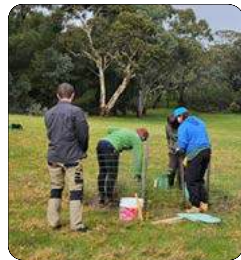
◆ Photo - Members of the 'Friends of Belair National Park' at a working bee planting seedlings to help rejuvenate the former golf course landscape

☐ If you are interested in helping, contact the group via social media, email: friendsofnp@outlook.com or call Craig on 0421 910 935.